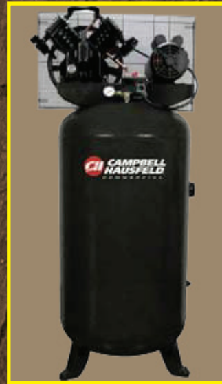
COMMERCIAL AIR COMPRESSOR