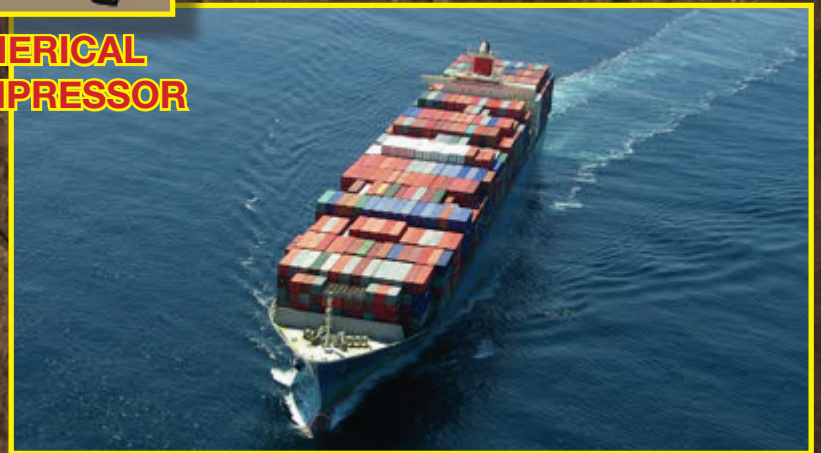
SHIPPING PROGRAM TO NEAREST PORT