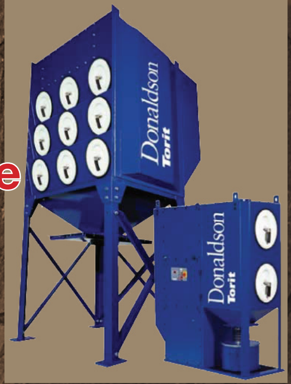
COMMERCIAL DUST COLLECTOR