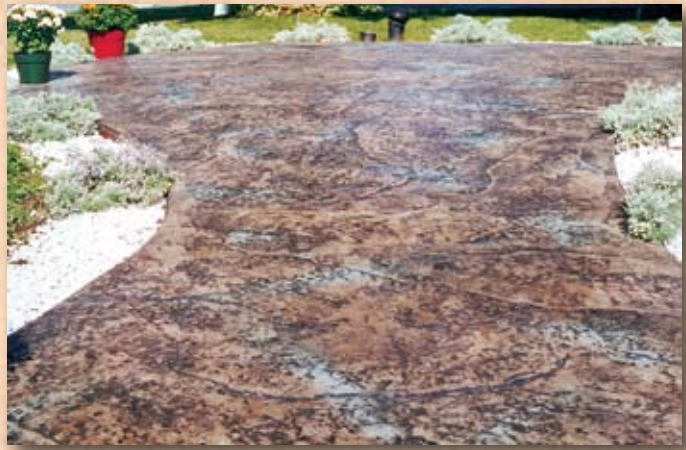
Penn Blue highlighting color was used on a Sandstone Integral color base, along with Charcoal Release to achieve an appearance with the Jumbo Stone Texturing pattern that individualizes this project.