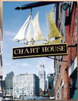
Chart House Boston, MA