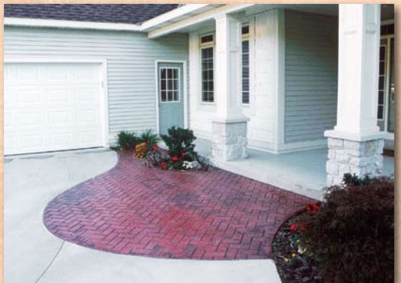
Herringbone Brick using Brick Red Integral color and Charcoal Release.