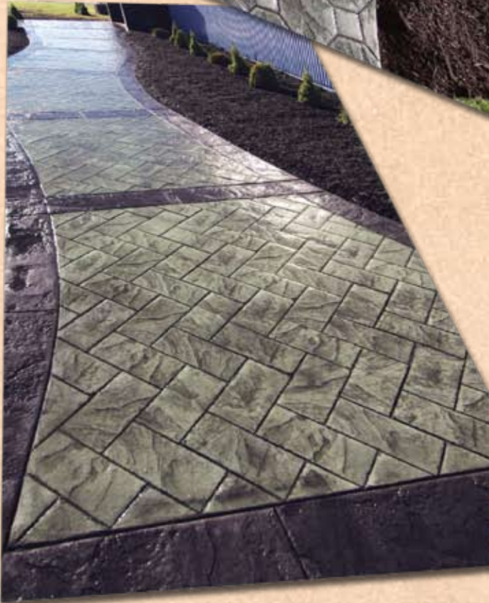
Large Herringbone Slate