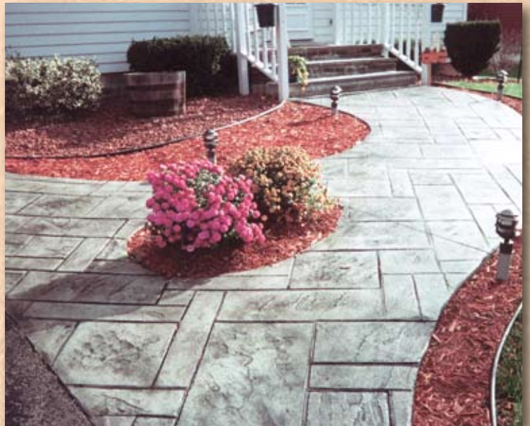
Silver Integral color and Charcoal Release were used with the Random Slate design to create this breathtaking sidewalk.