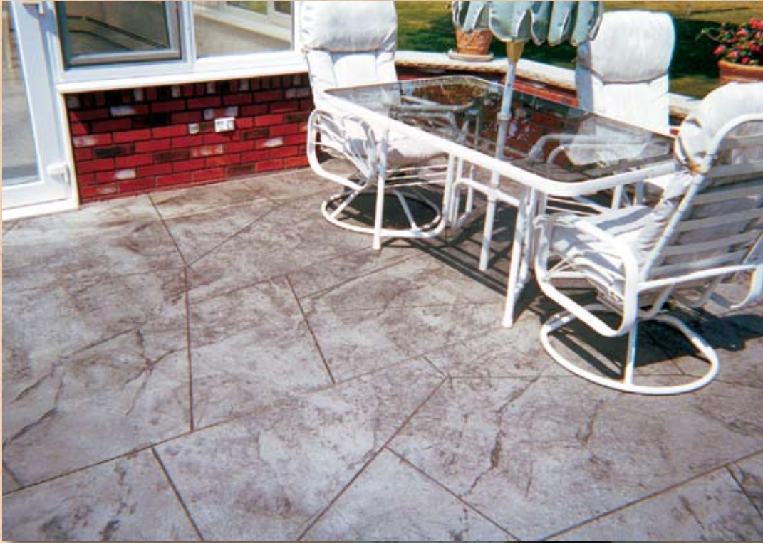
Jumbo Slate Texturing using Silver Integral color with Dark Gray Release. Then cut up using a grinder to simulate slate.