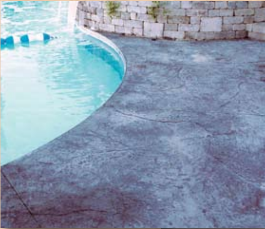
Jumbo Texturing Stone with Silver Integral color and Charcoal Release.