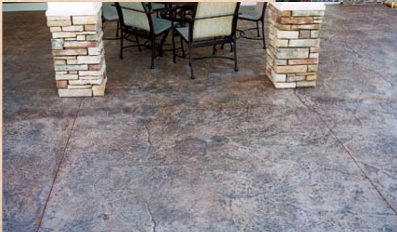
Stone Texturing using Sandstone Integral color and Dark Brown Release.