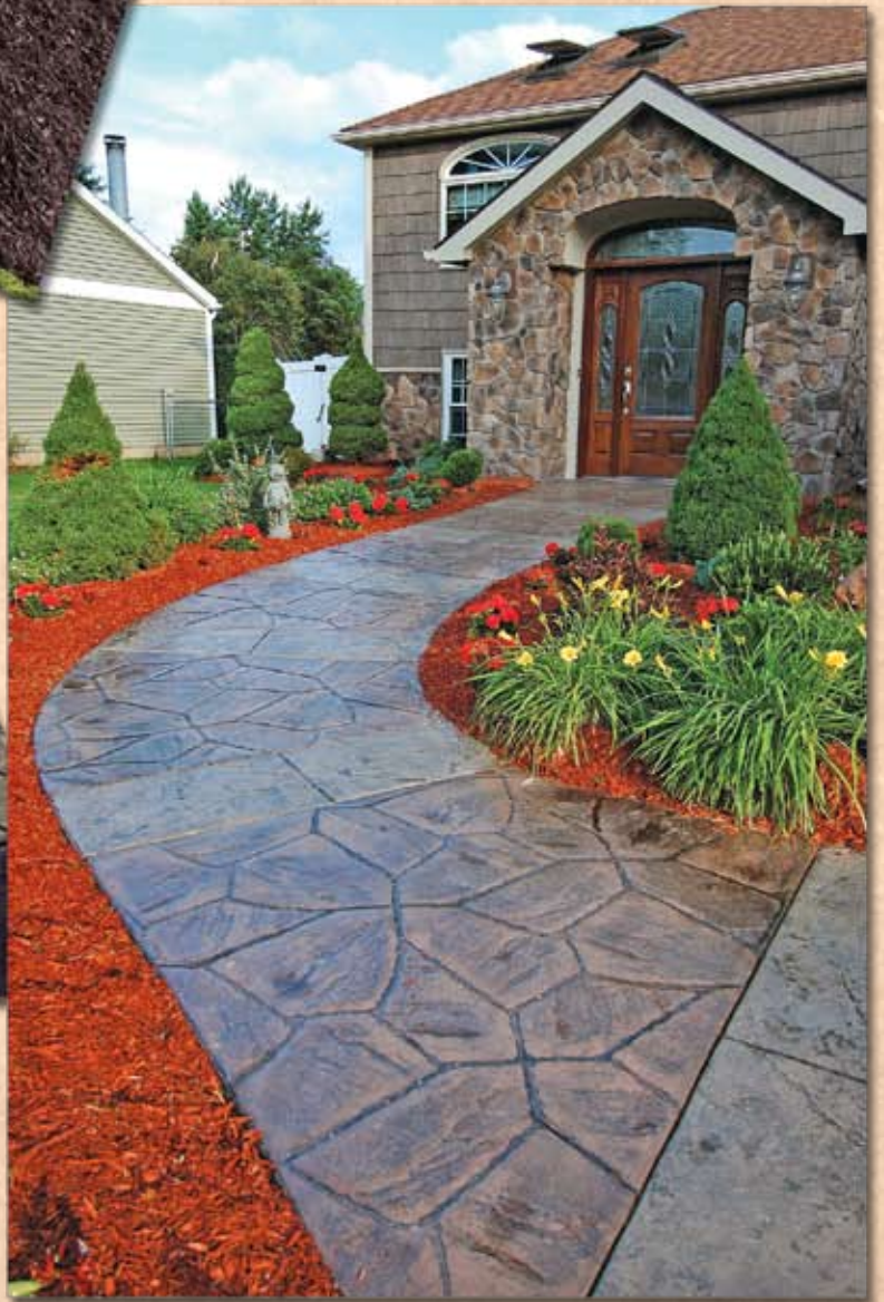
Arizona Flagstone with texturing stone borders