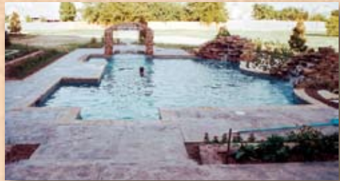
This Jumbo Stone Texturing design was cut into 30" x 30" diamonds to give a unique architectural appearance.