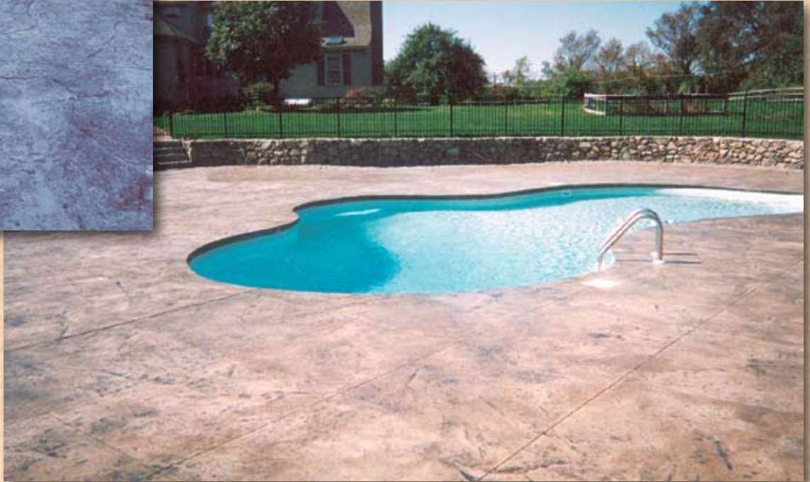
Texturing Stone design using Sandstone Integral color.