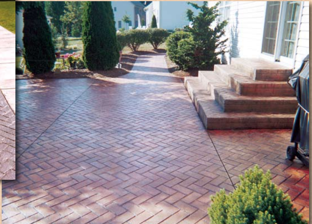
Rust Integral color with Dark Brown Release using a Herringbone Brick design.