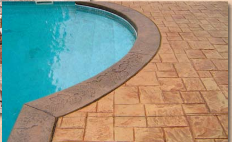
Pool Decks and Edges