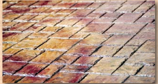
Ashlar Slate design in Sandstone Integral color and highlighted with Brick Red highlighting color.