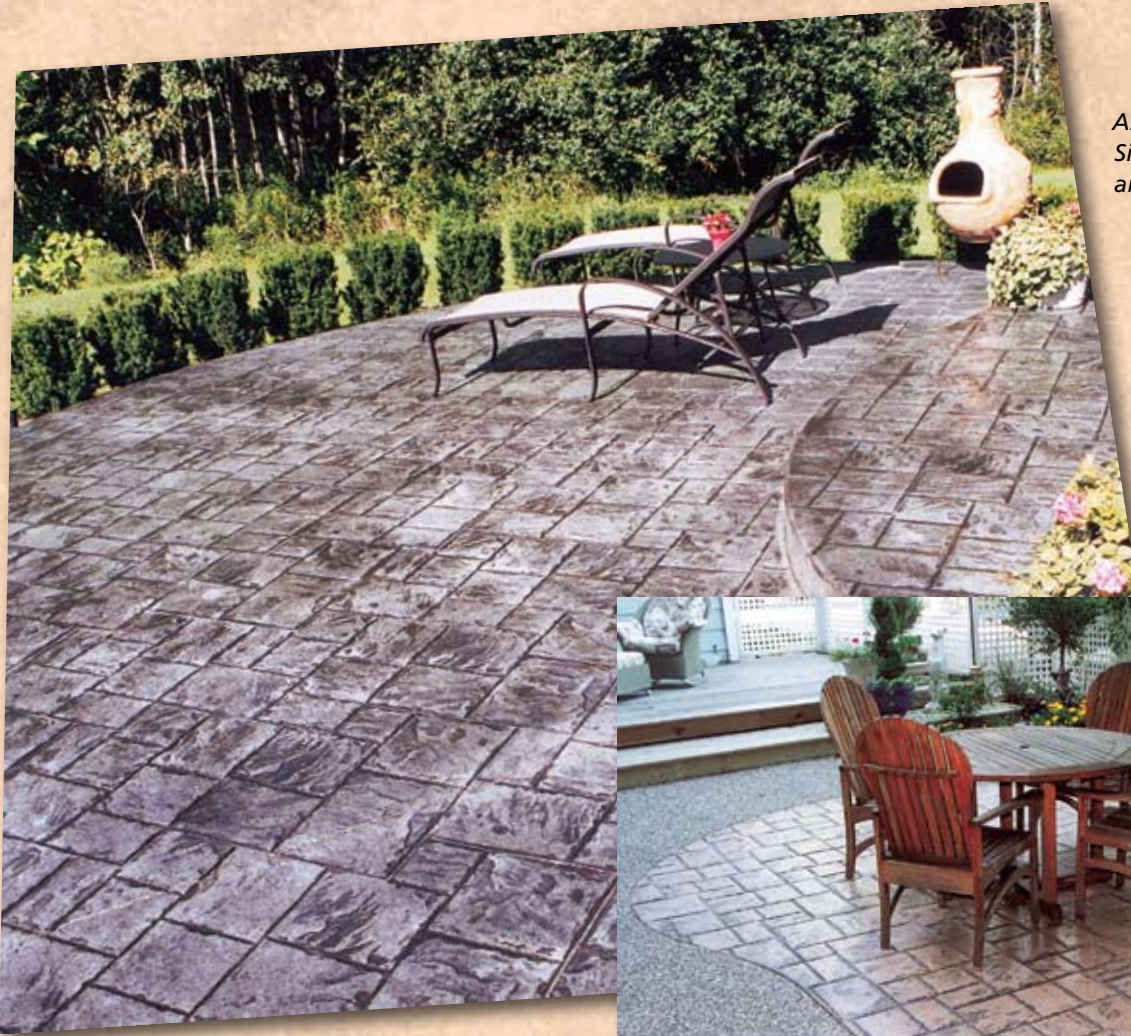
Ashlar Slate using Silver Integral color and Charcoal Release.