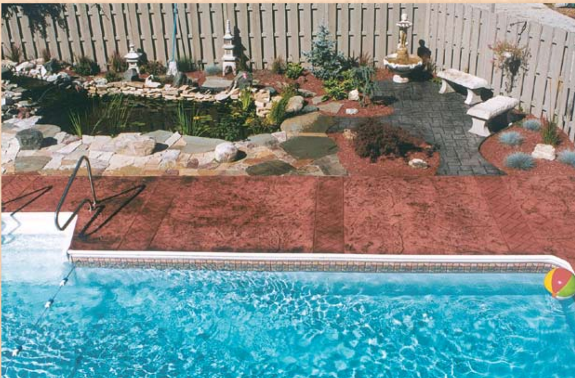
Texturing Stone design with Herringbone Border.