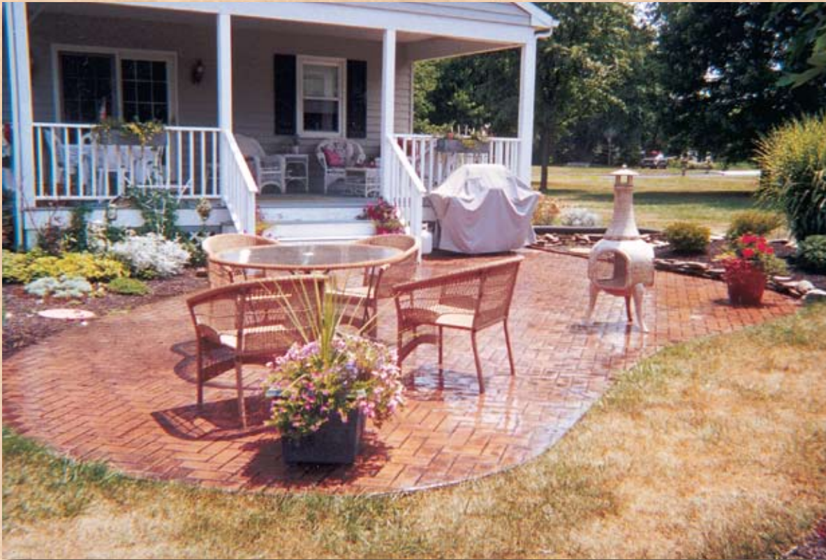
Rust Integral color with Dark Brown Release using Herringbone Brick.