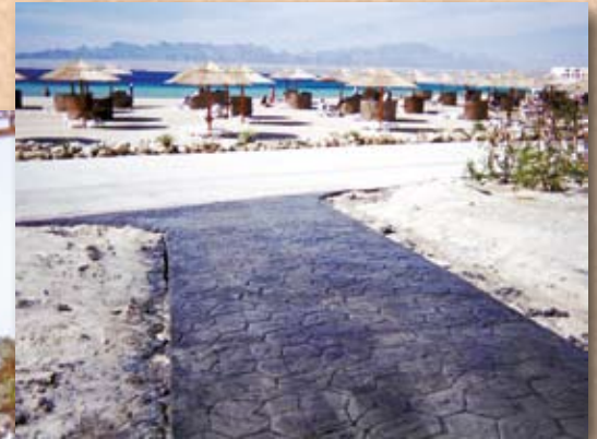
California Fieldstone using Dark Gray Integral color and Charcoal Release.